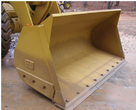
3.5 yd 3 Sand and Gravel bucket with additional side and floor wear material