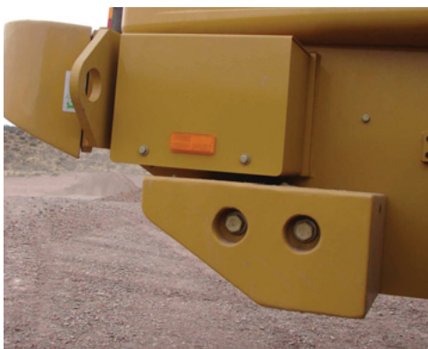
Additional Ready Mix counterweight package to optimize stability and performance