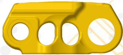
Crowned Duralink™ resists scalloping and delivers smoother ride